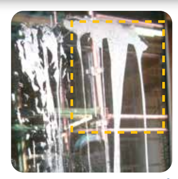
Before: Treated with EnduroShield® and covered in cement slurry.

Extensive on site testing with Bovis Lend Lease has proven EnduroShield® successful in protecting glass surfaces against etching from concrete and cement slurry during the building process. Testing has shown that glass panels treated with EnduroShield can be simply cleaned with a glass cleaner without the need to use razor blades. Tests were carried out where both concrete and cement slurry were poured on glass facade panels and left for extended periods. Results proved that over periods ranging from 8 days to 4 months the concrete and cement slurry were equally as easy to remove. No marks, pitting, or signs of etching were evident.